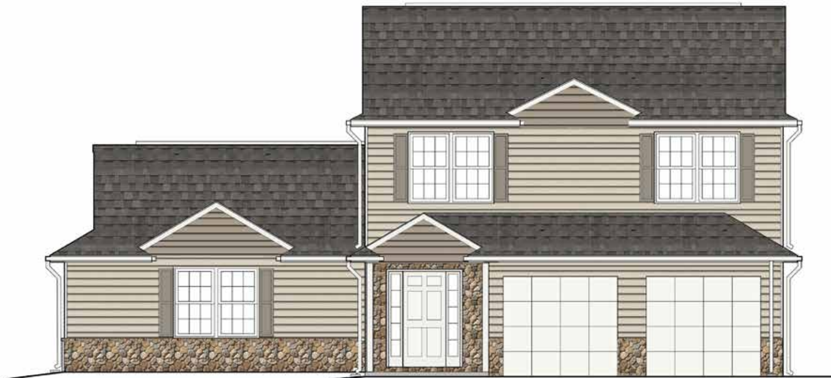
SPRUCE EXTERIOR ELEVATION SEE ADDITIONAL PLANS

1,800 SF, 3 Bedrooms, 2.5 Baths, Optional 4th Bedroom, Optional 1st FL Master Optional 507 SF Basement